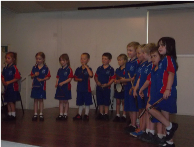
A great percussion item Kindergarten!