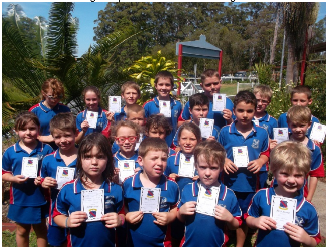
Congratulations to last week's Merit Award recipients!