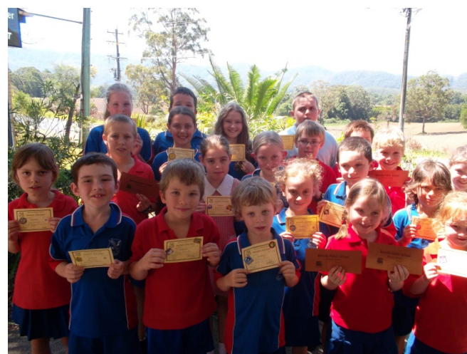
Congratulations to our Bonville students who received a Merit Award last week.