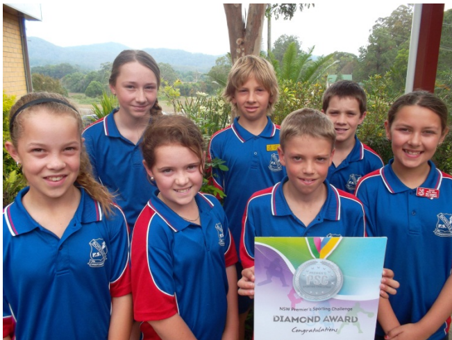
Bonville House Captains proudly displaying our latest award!

Last week Bonville PS received a Diamond Award for the completion of the Premiers Sporting Challenge. The Diamond Award was reached by calculating time involved in student daily fitness, weekly PE and Sport and other playground physical activity. This is our 2 nd year in a row achieving the highest level.